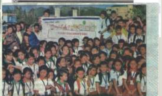
ఈ కార్యక్రమంలో పాల్గొన్న పిల్లలకు అందమైన పుస్తకాలను అందించడం ద్వారా వారి విద్యాభ్యాసంను ప్రోత్సహించడం లక్ష్యంగా పెట్టుకుంటున్నాం.